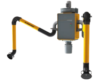
WallPro Double with Direct Mounted (DM) extraction arms