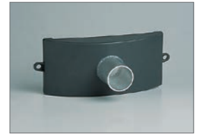
Hose connection HCH-45