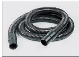
Hose length 2.5 m or 5 m