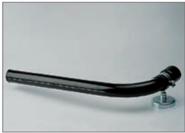
Extraction nozzle EN-40