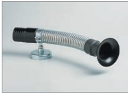
Extraction nozzle EN-20