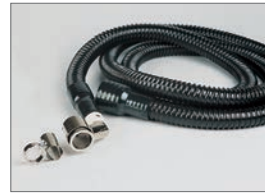
Nozzle kits NKC/NKT